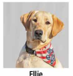
Ellie Company Mascot