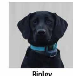
Ripley Company Mascot