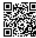
Visit Our Website